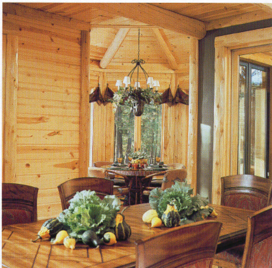
This casual eating area in the main-level turret room is a perfect place to grab a bite. The miniature lampshades and greenery on the woven iron chandelier soften this focal point accessory while also complementing the view outside.