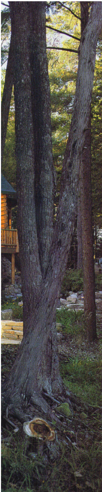
Town & Country Cedar Homes photos