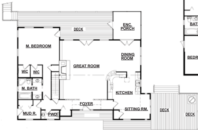
MAIN LEVEL PLAN 1,986 S.F.